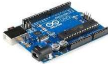
Fig 2- Arduino