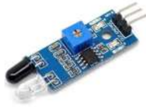
Fig 5 – IR SENSOR