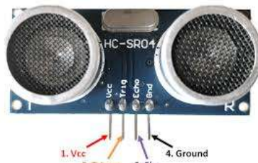
Fig 3 -Ultrasonic Sensor

The Ultrasonic Sensor sends out a high-frequency sound pulse and then times how long it takes for the echo of the sound to reflect back. The sensor has 2 openings on its front. One opening transmits ultrasonic waves, (like a tiny speaker), the other receives them, (like a tiny microphone). The speed of sound is approximately 341 meters (1100 feet) per second in air. The ultrasonic sensor uses this information along with the time difference between sending and receiving the sound pulse to determine the distance to an object.