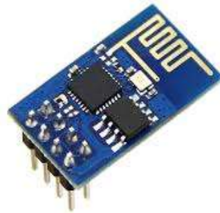
Fig 4 - Wifi Module

This module has a powerful enough onboard processing and storage capability that allows it to be integrated with the sensors and other application specific devices through its GPIOs with minimal development upfront and minimal loading during runtime. The ESP8266 supports APSD for VoIP applications and Bluetooth co-existence interfaces, it contains a self-calibrated RF allowing it to work under all operating conditions, and requires no external RF parts. There is an almost limitless fountain of information available for the ESP8266, all of which has been provided by amazing community support. In the Documents section below you will find many resources to aid you in using the ESP8266, even instructions on how to transforming this module into an IoT board. internet of things (IOT). Here ESP8266 Module is used and as well as it is a wireless network. It is a WIFI Module. ESP is 3.3v device and never connect to 5V it will get damage.