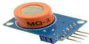
Fig 7 - MQ3 gas sensor

A gas sensor is a device which detects the presence of different gases in an area, especially those gases which might be harmful to humans or animals. The developments of gas sensor technology have found wide applications in environmental monitoring, protection, etc. It is well known that properties of the sensing materials such as surface area, agglomeration and porosity greatly affect the gas-sensing characteristics, such as sensitivity, selectivity, time response, stability, durability, reproducibility and reversibility. Various types of materials such as semiconductors, polymers and organic/inorganic composites have been used as sensing material to detect the targeted gases based on various sensing techniques and principles. A higher specific surface of a sensing material leads to a higher sensitivity, therefore many techniques have been adopted to increase the specific surface of material, especially to form the nanostructures. Thus, large specific surfaces are expected to be ideal candidates as the structure of sensing materials. Recently electrospun fiber-based gas sensors have attracted much attention as the surface area-to-volume ratio of nanofibers is very high.