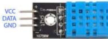
Fig 6- DHT 11

The DHT11 is a commonly used Temperature and humidity sensor. The sensor comes with a dedicated NTC to measure temperature and an 8-bit microcontroller to output the values of temperature and humidity as serial data. The sensor is also factory calibrated and hence easy to interface with other microcontrollers. The sensor can measure temperature from 0°C to 50°C and humidity from 20% to 90% with an accuracy of \pm 1^\circ\text{C} and \pm 1\% .